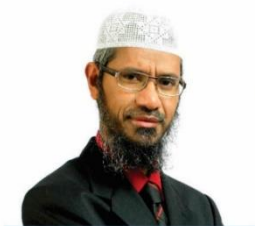
Dr. Zakir Naik