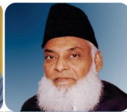
Dr. Israr Ahmed